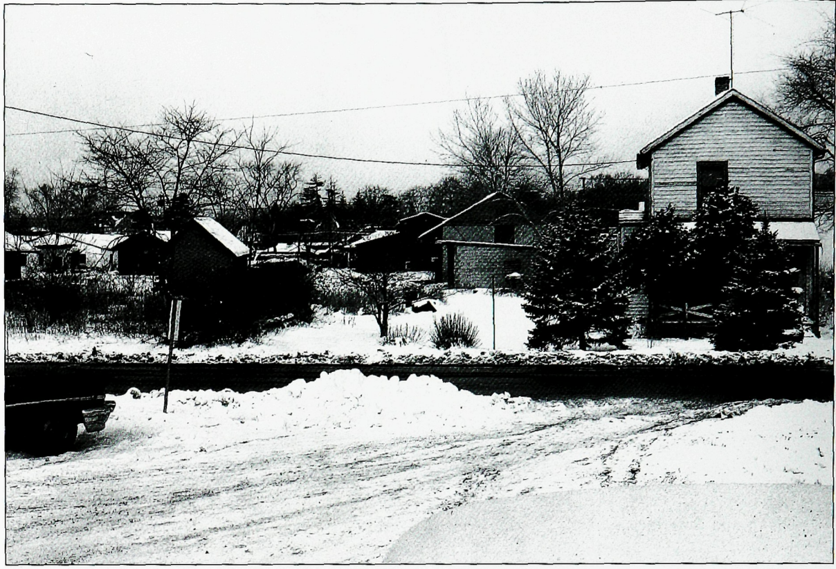
A BACK-DOOR ANGLE. Taken from the Presbyterian church, this 1950 view looks across La Grande Avenue into the area behind the stores of Martine's west side. The large storage shed of the lumberyard is still present.