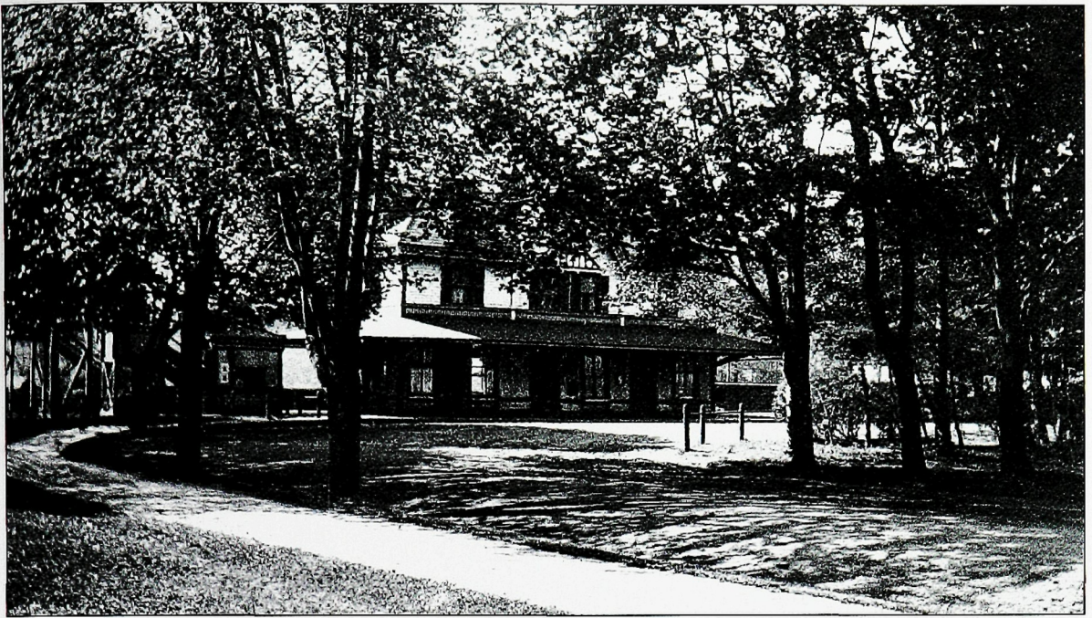
RAILROAD BUILDINGS. The north-side railroad station is sheltered among the trees that line the exit road and the sidewalks. The wooden structure of the pedestrian overpass is evident here, as well as a small building of the kind used for selling newspapers and convenience items.