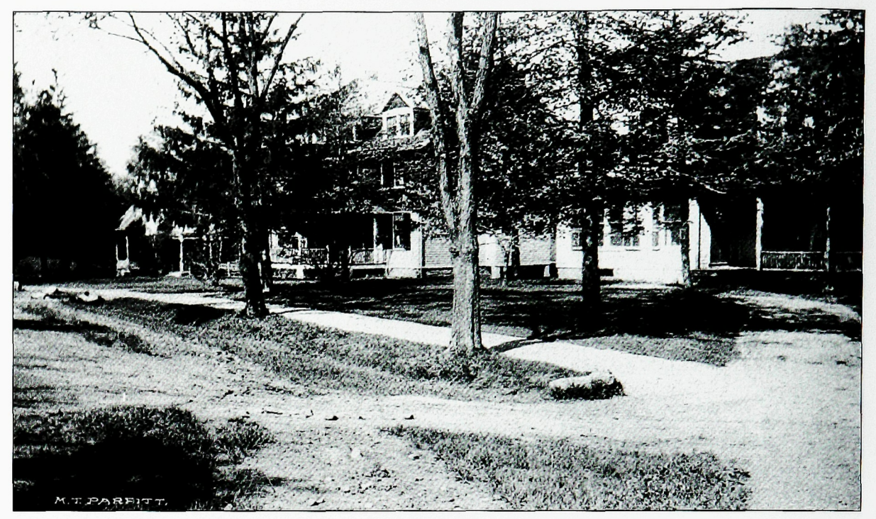
A PRIME LOCATION. The close proximity of North Avenue to the railroad station attracted homeowners. Some of the homes were built by the Central New Jersey Land Improvement Company, the real estate arm of the railroad.