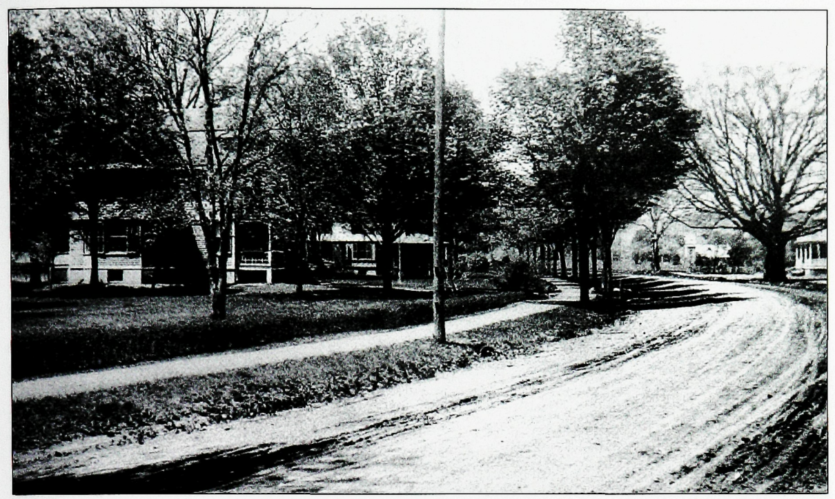
AN UNPAVED THOROUGHFARE. This 1910 view, looking north on Martine Avenue from Midway, depicts a dirt-road surface; at that time, there were very few automobiles. The Fanwood Oak makes a stately presence.