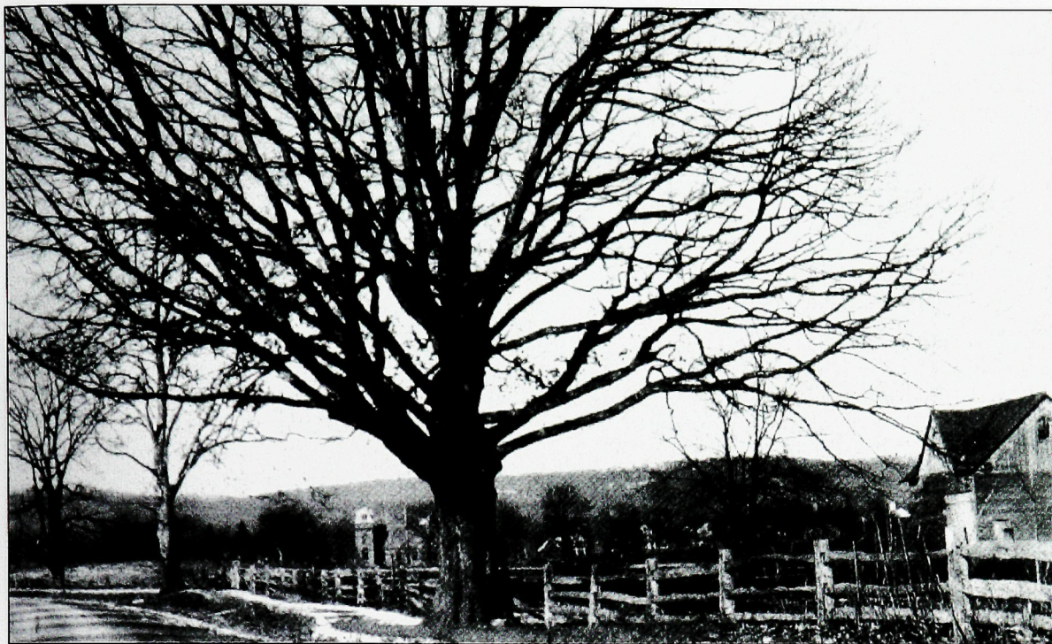
THE MIGHTY OAK. This 1890s photograph of the venerable 300-year-old Fanwood Oak Tree captures a view of All Saints Episcopal Church to the left. The tree to the left of the Fanwood Oak is a sycamore that still stands proudly on Martine Avenue today. The Fanwood Oak succumbed to old age and had to be removed in 1998.