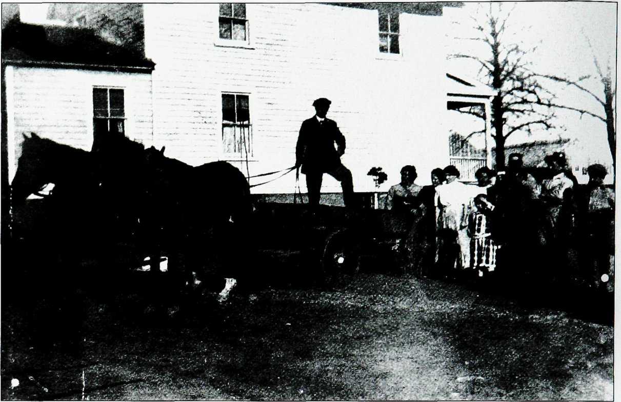
A RURAL SETTING. During the 1890s, the Venezia farm, one of several in Fanwood, was bordered by Terrill Road and Midway Avenue. The horse-drawn wagon was a principle work implement of the farm at that time.