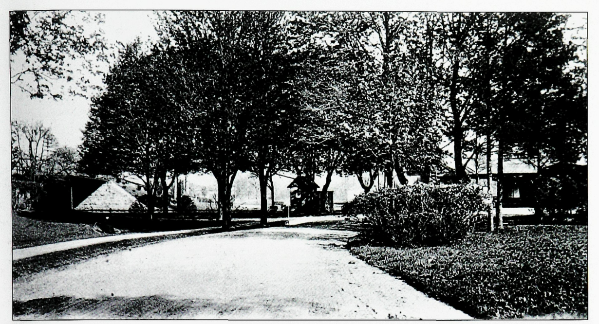
SPACIOUS GROUNDS. The lawns and gardens surrounding the newly occupied north-side railroad station earned the title of Station Park. A wooden truss bridge, with its stone revetments, supported Martine Avenue over the railroad tracks.