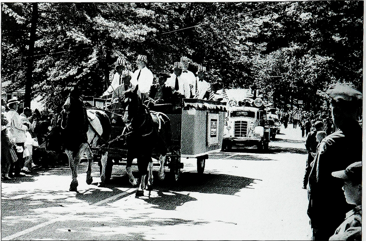
PARADE LOVERS. An overflow crowd of Fanwood residents observes the horse-drawn exhibit of the Elks Club as the Memorial Day parade of 1961 makes its way northward along tree-lined Martine Avenue.