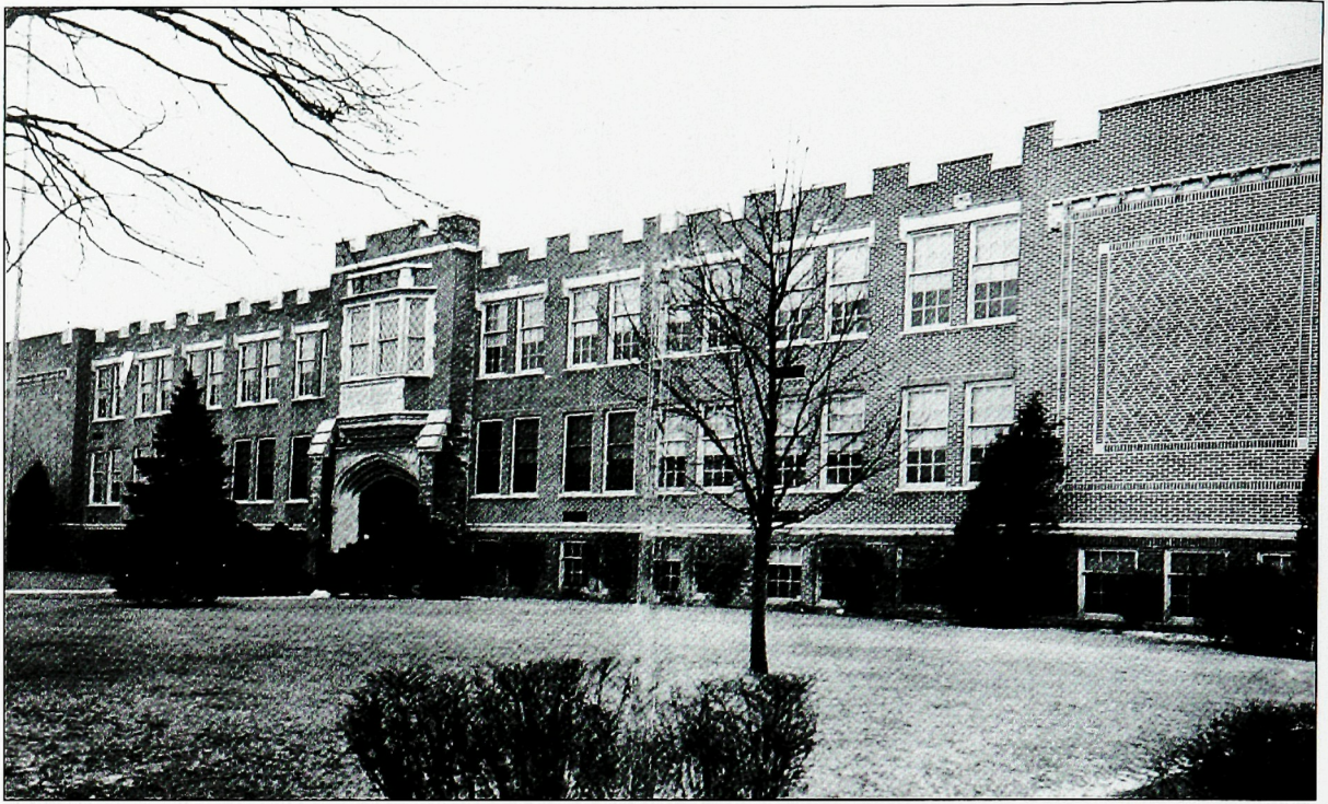
THE FIRST HIGH SCHOOL. Fanwood teenagers attended high school in Scotch Plains. This building was constructed in 1926 on Park Avenue and served as the high school until 1958. It became a junior high and is now a middle school for grades five through eight. Many alterations have been made to Park School over the years.