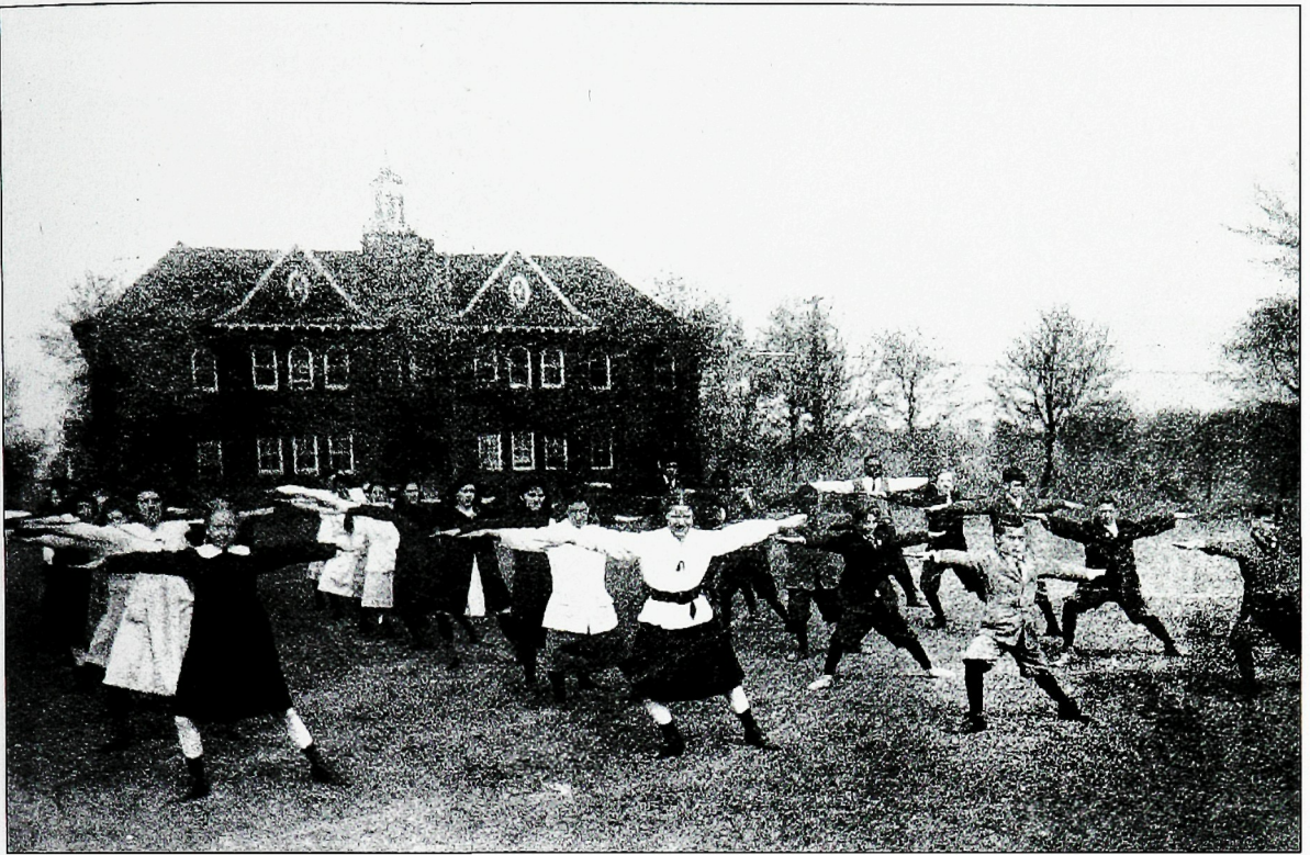
WARMING UP. School One students get the day started in front of the building in an early photograph. Note the more formal attire, as compared to the current outfits worn by children.