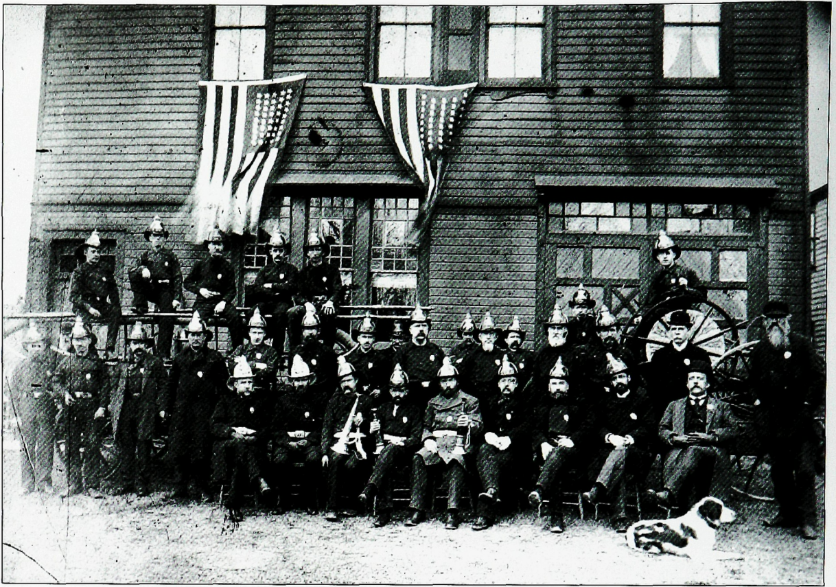
THE EXCELSIORS. In 1880, Fanwood Township was composed of the two communities we know today as Fanwood and Scotch Plains. In this photograph, members of the Excelsior Fire Department pose in front of their firehouse in fire-fighting gear, with their mascot nearby.