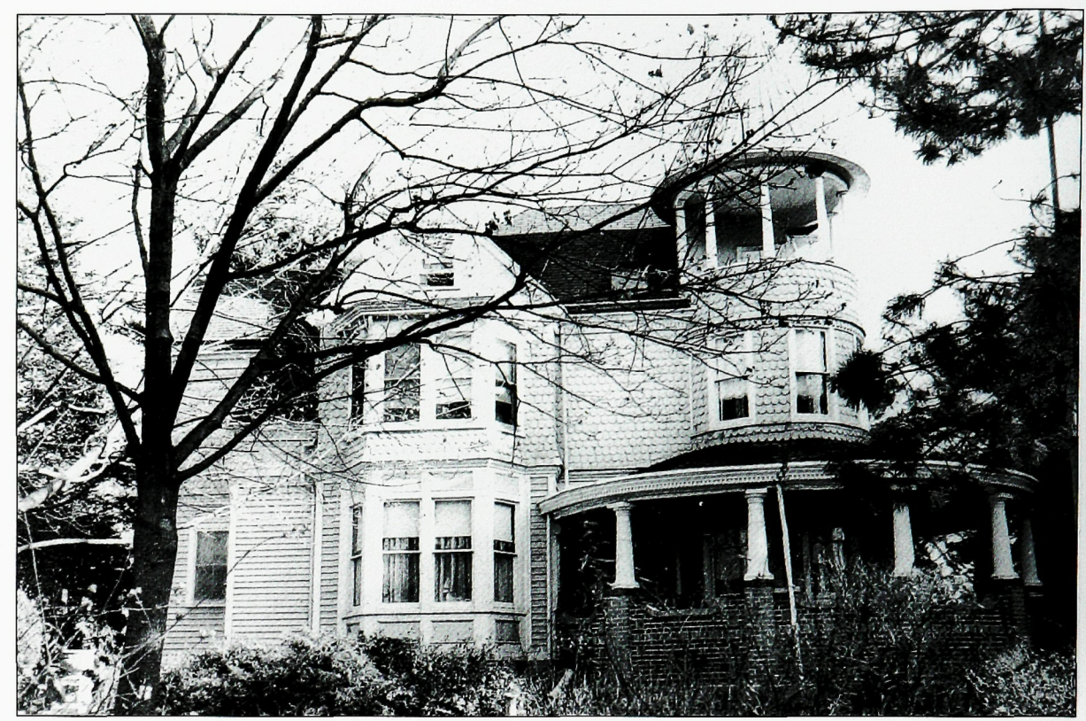
313 SOUTH AVENUE. This beautiful mansion, looking upon South Avenue, was torn down in the 1950s. Curved shingles on the upper part of the house and the rounded portico and stately columns made this home an impressive sight. An office building stands in its place today.