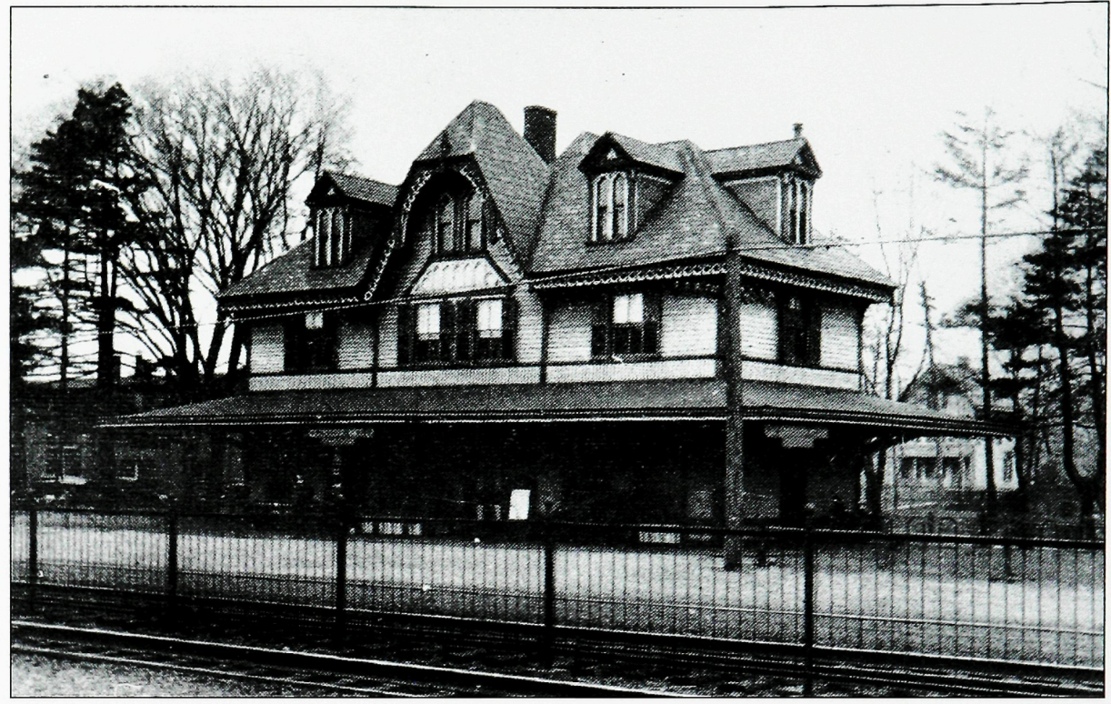
THE SISTER STATION. The Fanwood station was one of seven stations built by the Central Railroad of New Jersey in the late 1880s. This sister station was located on Clinton Avenue in Plainfield and was later demolished.