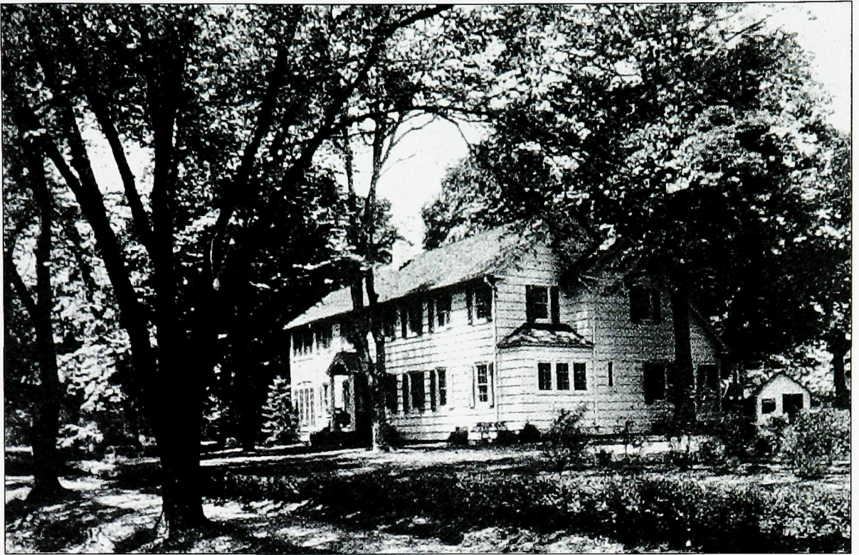
AN OLD STATION TO A RESIDENCE. When the Central Railroad of New Jersey abandoned the Midway Avenue route in 1874, the railroad station became a private residence, seen here in the 1920s after extensive renovations. The house is on Fanwood's local registry of historic structures.