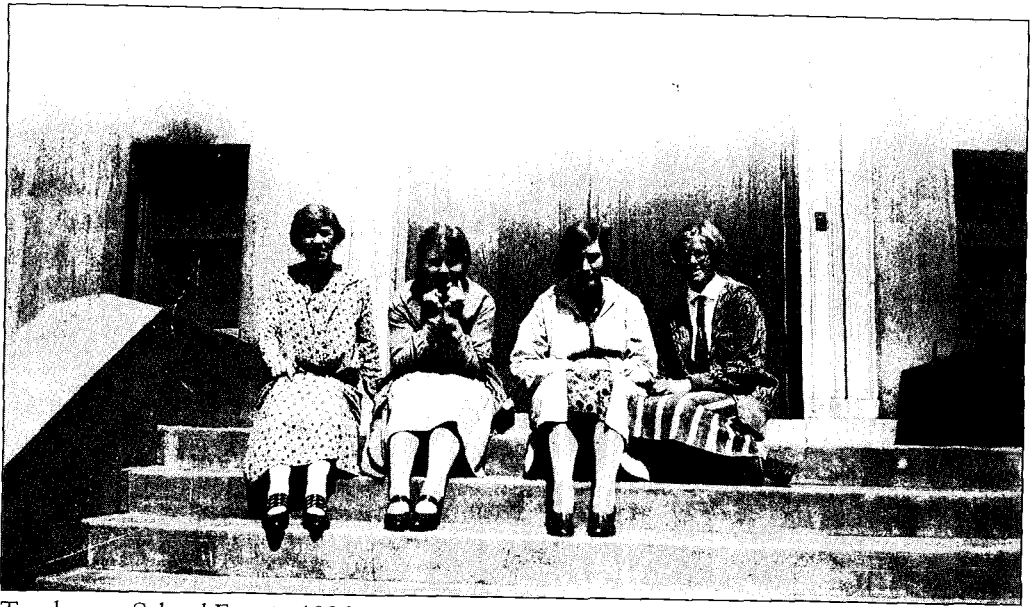
Teachers at School Four in 1926.