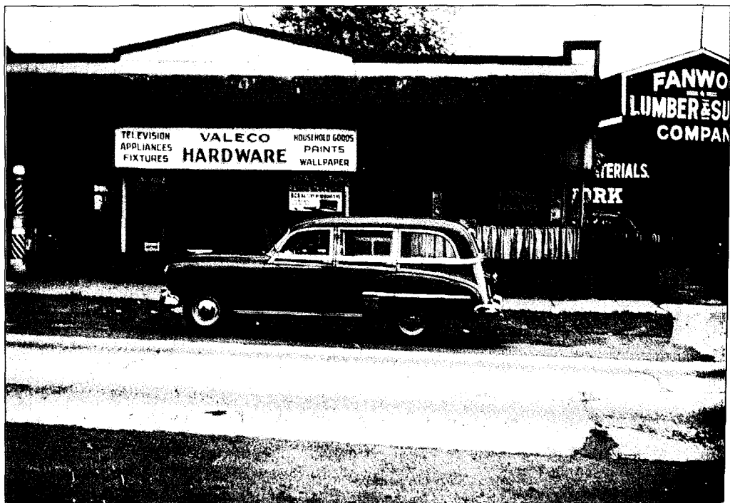
A c. 1940 photograph of the second Fanwood Library, located on South Avenue in Fanwood.