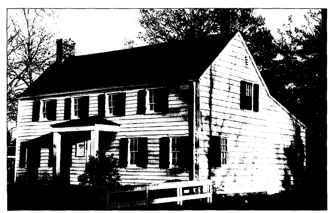
The Osborn-Cannonball House undergoing an exterior renovation by the Historical Society of Scotch Plains and Fanwood. The renovation was designed to recapture the home's original colonial appearance; notice, for example, the front porch has been decreased in size.