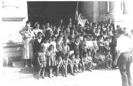
Pompeii My mother posing with a group of school children.