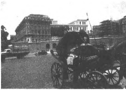
Rome, in style.