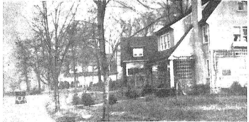
Russell Road in the 1930's was lined with deciduous trees and new homes of the Colonial Revival style.

After World War II, Fanwood again grew rapidly, with over 1,300 homes, approximately one-half of today's total number of residences, constructed in the twelve years from 1946 to 1957. The major development was concentrated in two areas. The first, bounded by Martine Avenue, Beech Avenue and Trenton Avenue, was entitled Fanwood Hills. The homes constructed here, primarily Cape Cods, today line Shady Lane, Poplar Place and the surrounding streets. The second major area, the Sun Valley section bordered by Westfield Road, Woodland Avenue and Midway Avenue, was a rugged wooded and hilly area prior to its residential development. Among the names given to the sections of this area were Midway Manor (Glenwood Road), Waldon Park (Waldon Road, Tillotson Road and Linda Place), and Sun Valley (Ranier Road, Shasta Pass and Sun Valley Way). Other areas developed during these years include Marion Gardens (Vinton Circle), Woodlawn Park (Mary Lane), Midway Estates (between Midway and Madison Avenues), Terrill Manor (Brohm Place), Glenside Park (a section of La Grande Avenue), Oakwood Manor (Arlene Court, Deborah Way, Birchwood Terrace, Oakwood Court, Estelle Land and Pleasant Avenue), Portland Gardens (Portland Avenue) and High Oaks (Nichols Court).