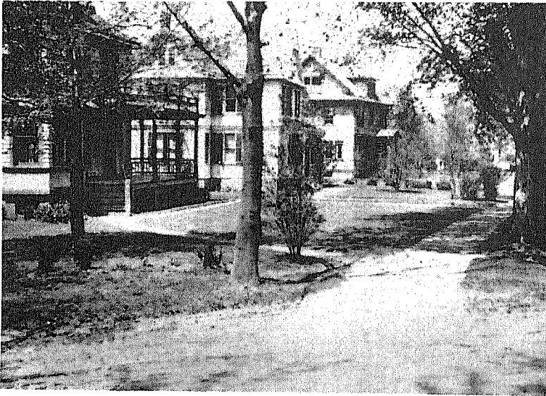
Gracious homes and trees lined Martine Avenue as the Borough developed at the turn of the century.