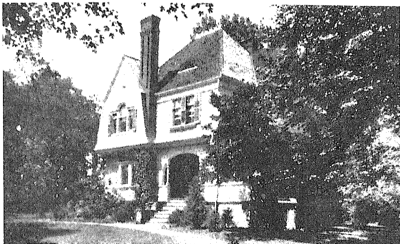
Walter S. Force, the first borough tax collector, resided in a stately home on North Avenue facing the train station.