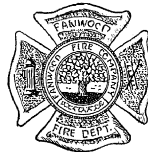
On the left is the older style uniform badge with the members roster number; on the right the present uniform badge which incorporates the borough seal.