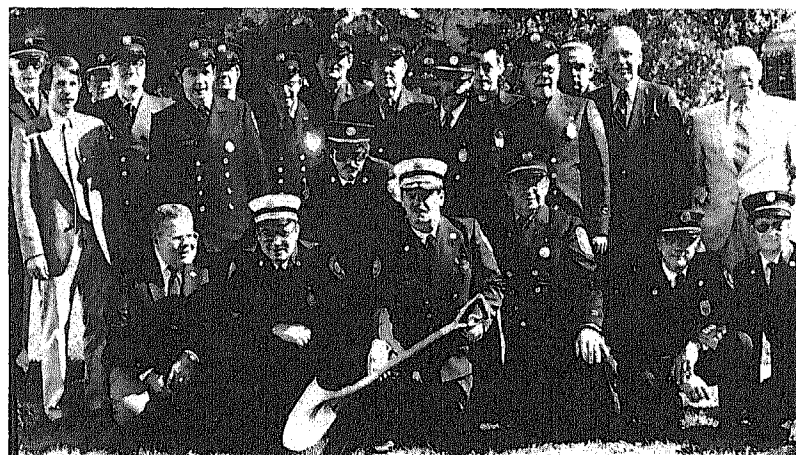
Ground breaking for the new firehouse took place on October 16, 1983 with fire fighters and borough officials taking part.

During 1975 the membership voted to support the borough's movement for a new municipal complex. The discussion had been ongoing and the membership hoped their support would promote quicker action. The debate/battle for a new firehouse lasted for the better part of ten years, finally the dedication of a new firehouse was held during December 1984.