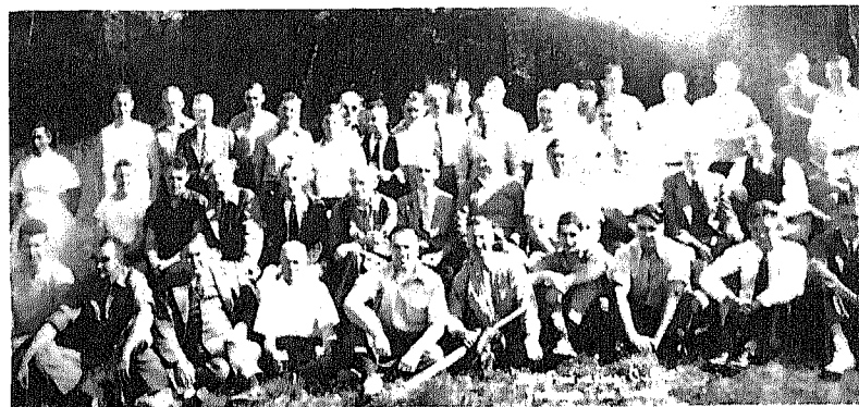
One of several events commemorating the 50th anniversary of the Fire Company was a picnic held at Hilltop Grove in Berkeley Heights on October 13, 1940.

On June 8, 1940, the membership voted unanimously to continue the corporate existence of the Fanwood Fire Company in perpetuity. A celebration of the fiftieth anniversary was held on October 16, 1940, at the Maple Tree Inn, which was located on the southeast corner of Terrill Road and South Avenue.