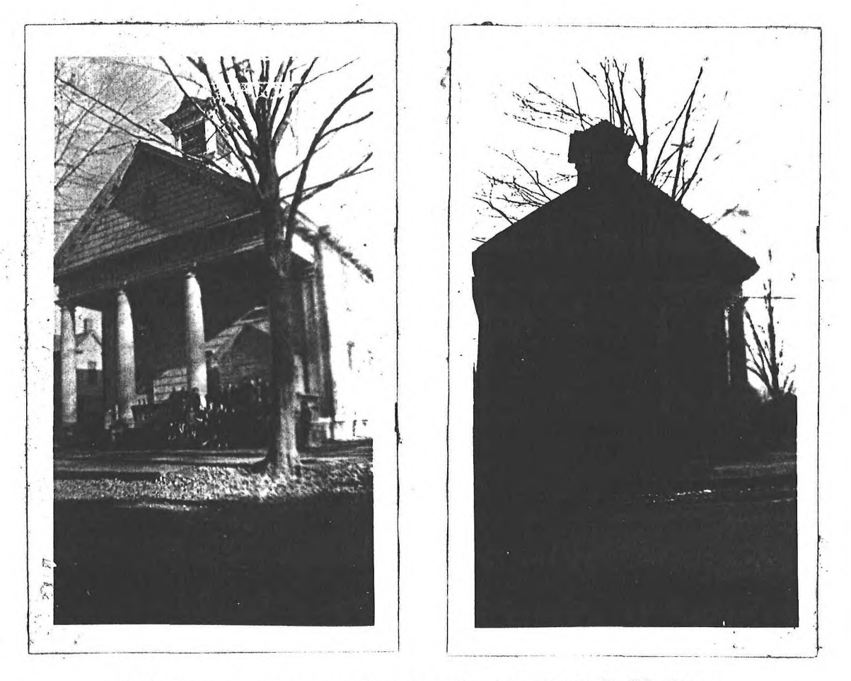
This was our second school, in Scotch Plains.